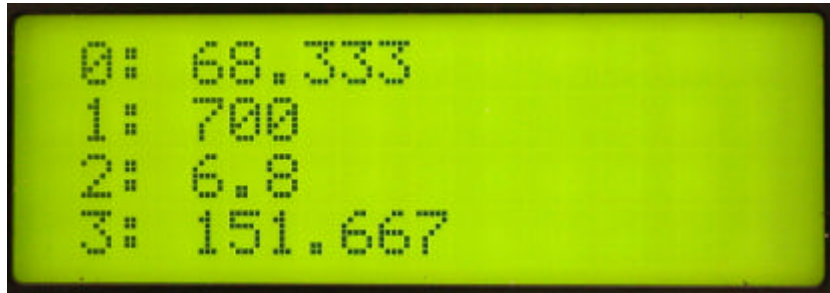
Fig. 2 That's how WERT_01.TIG shows the transmitted setting values

Actually the program shows in its present version only the four setting values (Fig. 2). As you can see, the data format adapts itself exactly to the settings of the sliding controls in the PC program.